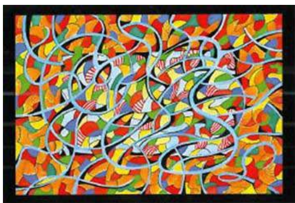
Abstract | 88791