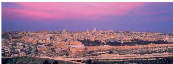
Jerusalem | 01763