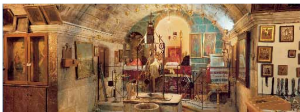
Jacob's Well, Palestine | 01762