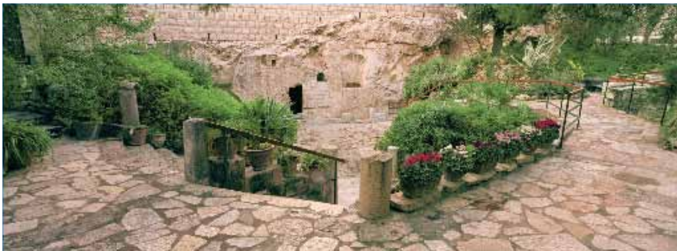
The Garden Tomb | 01765