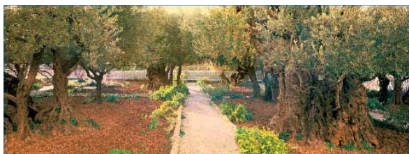
The Garden of Gethsemane | 01764