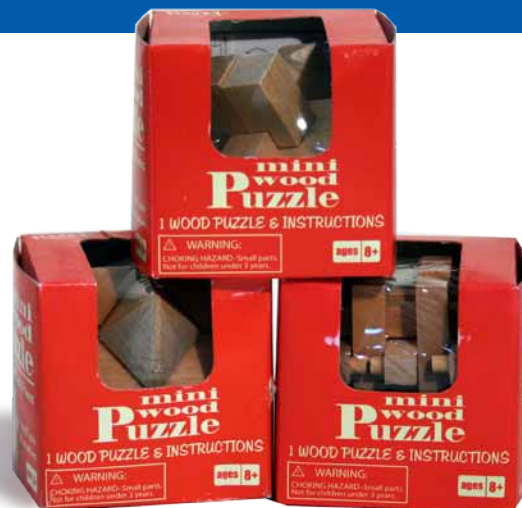
Mini Brain Puzzles (assorted) | 51500 Solid wooden puzzles. Includes instructions. 1+ players | ages 8+