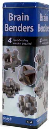
Brain Benders in a tin | 59500 Four mind-bending wooden puzzles in a durable tin. 1+ players | ages 5+