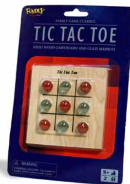
Tic Tac Toe | 50270 Solid wood game board and glass marbles. 2+ players | ages 5+