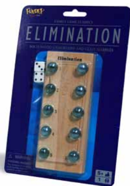
Elimination | 50280 Solid wood game board with glass marbles and plastic dice. 1 players | ages 5+