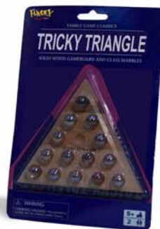
Tricky Triangle | 50260 Solid wood game board and glass marbles. 2 players | ages 5+