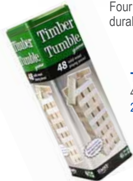
Timber Tumble in a tin | 59850 48 piece stacking game. 2+ players | ages 5+