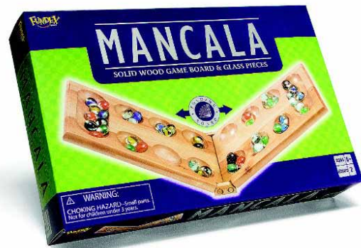
Folding Mancala | 53600 Solid wood game board and glass pieces. 2 players | ages 6+