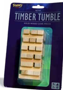
Timber Tumble | 50850 Solid wood game pieces. 2+ players | ages 6+