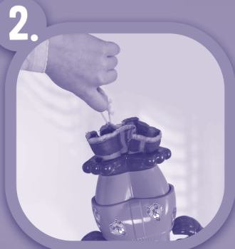
Turn the Fox upside-down and pull the string under his feet.