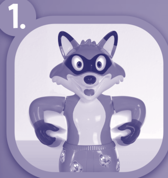
Raise the Fox's arms up.