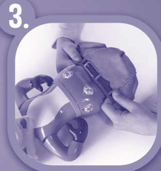
Pull his pants up around his waist, and adjust them so the pockets are accessible.

Collect the chickens and form a pool. Deal one chicken coop per player.